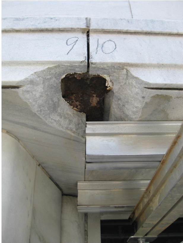
Failed Stone at eyebrow.

cluding the ratio of cementitious material to sand and the abundance of free lime. The testing also determined the aggregate characteristics and ASTM C270 mortar type. This testing was required to develop recommendations for replacement mortar.