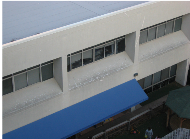
Distressed EIFS facade.

A visual condition survey was conducted for the front and two side stone facades as well as the rear elevation which consists of Exterior Insulation and Finish System (EIFS) façade. The façade was ob-