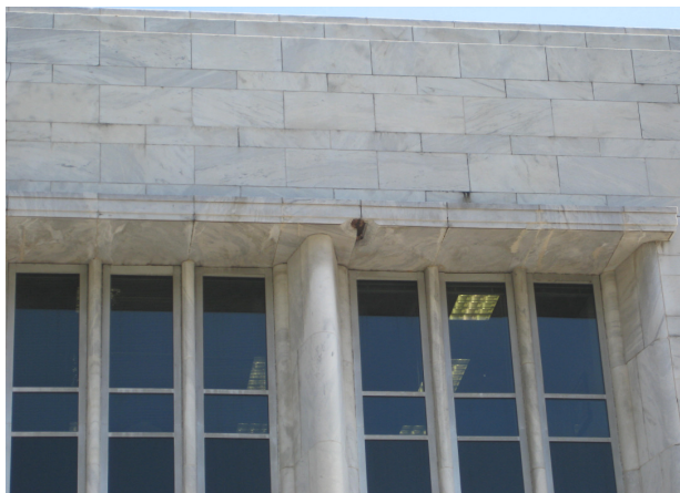
Distress Stones at Eyebrow.

TEC Services reviewed available architectural and structural drawings to observe typical stone façade